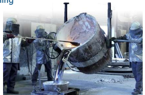
Pouring of a 2500 kg aluminum casting